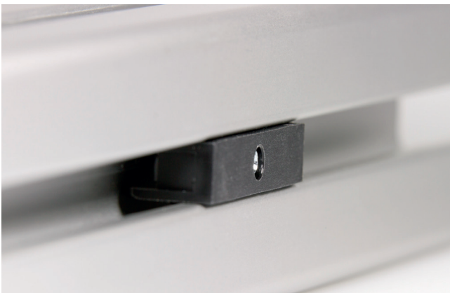
Magnetic stone for aluminum profiles - or custom-made grooves