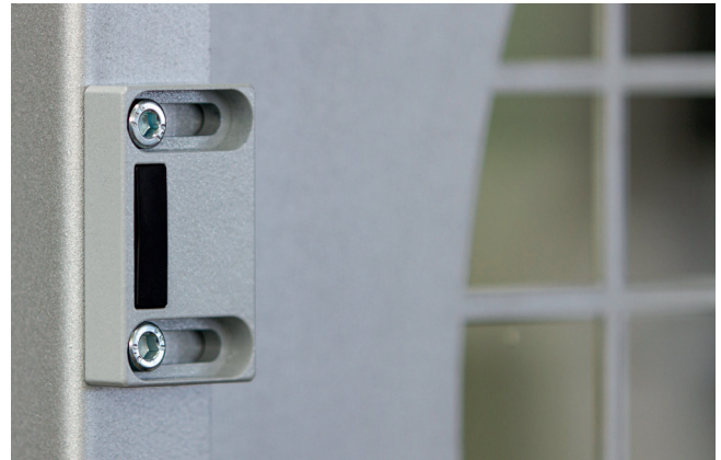
Slotted holes allow subsequent adjustment of the fitting