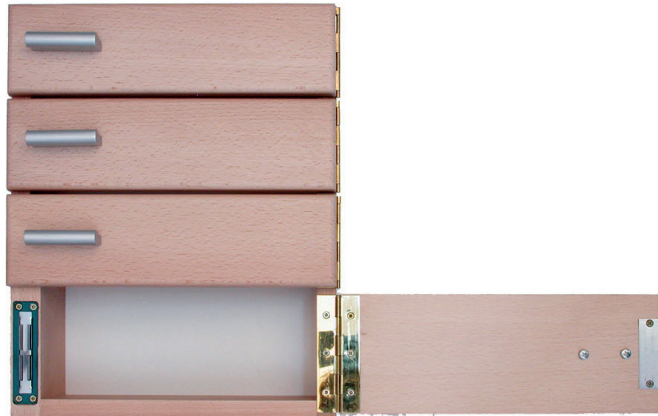
Example of magnetic furniture fittings

The designs of this product family are just as versatile as the installation situations for magnetic fittings. From round to square, made of plastic or metal, with a front or side holding surface, damped or rigid, for screwing on or clipping in. Our small powerhouses offer practical solutions, whether for kitchen cabinets, living room cabinets or other pieces of furniture.