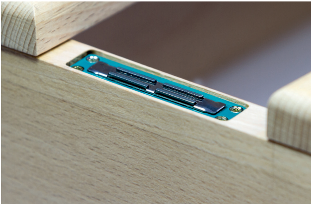
Flush installation in a piece of furniture