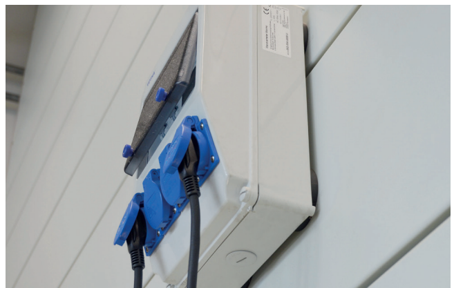
Fastening switch cabinets or sockets magnetically