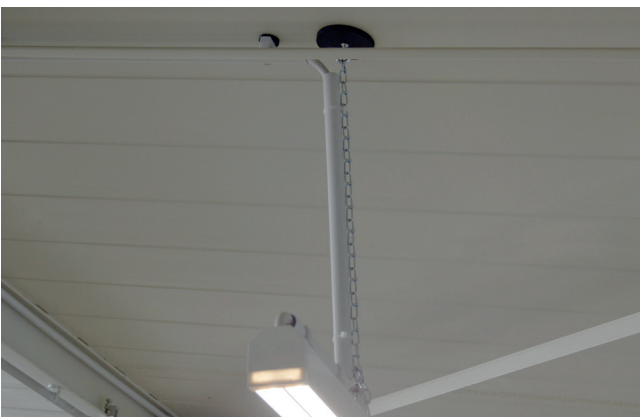
Suspending lights from the ceiling