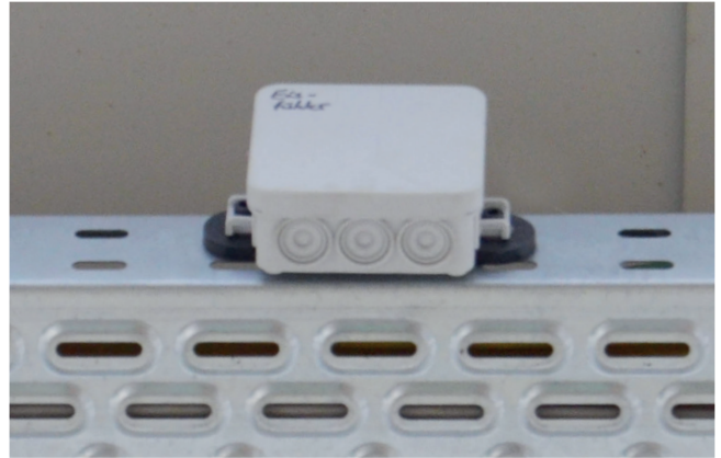
Fastening junction boxes magnetically