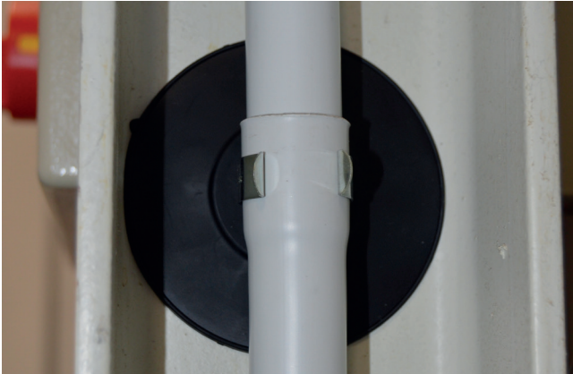
Fastening pipes directly to steel beams