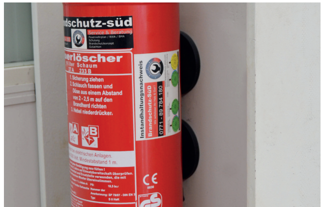
Mounting of fire extinguishers etc. directly on the steel girder