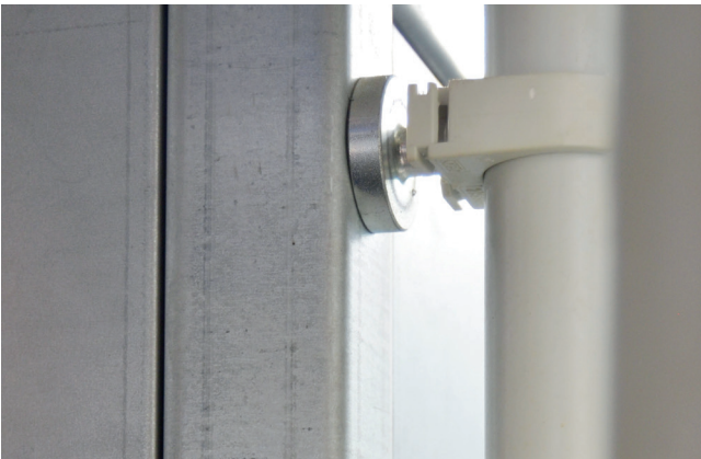
Fasten cable ducts magnetically