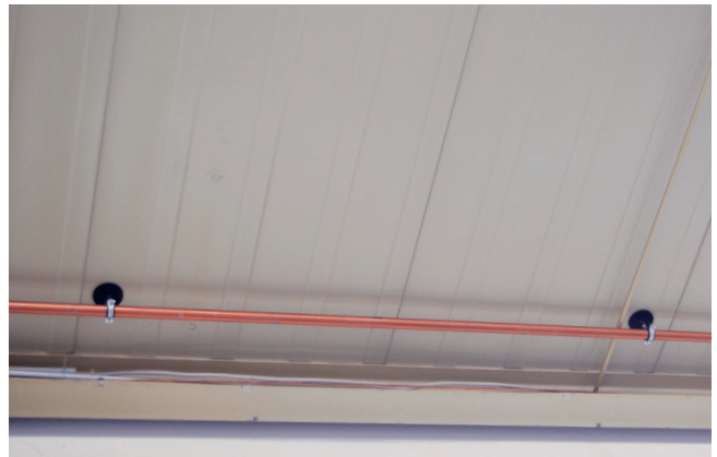
Magnetic pipe installation on the ceiling