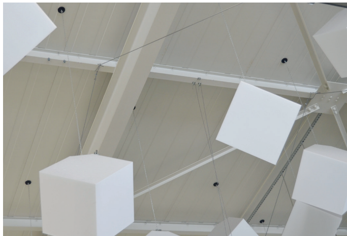
Suspension of noise protection elements

Advances in technology are enabling innovative magnetic solutions that improve the quality and performance of building installations.